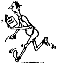
1977/78 CLEARLY STATES THAT BUTLER STRIDE ALL PORTIONS IN A SINGLE REGION (THE FOOT) IF MADE THE PITCH PROPER...