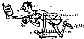
... THAT IS TO SAY THE FRONT FOOT MUST REMAIN BEHIND THE PITCHING CREASE... FRONT FOOT (LEFT) BEHIND PITCHING CREASE... FRONT CREASE BEHIND PITCHING FOOT.....