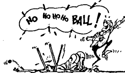
NO NO NO NO BALL!